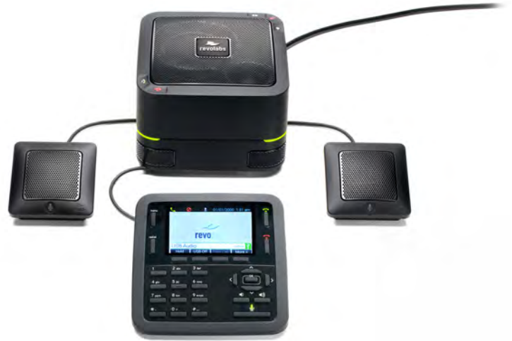
IP & USB Conference Phone with Extension Microphones